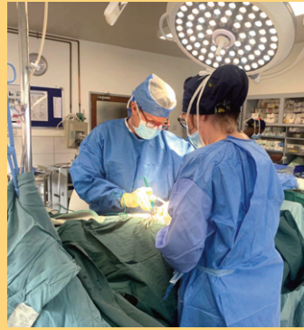
HOSPITAL LINEN BOXES: 233