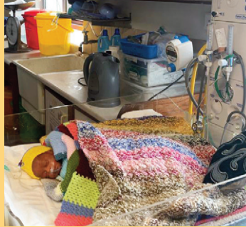
BABE ONLY PACKS: 250 MOM & BABE PACKS: 342 HOME BED PACKS: 389