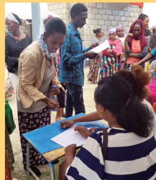
HOUSEHOLD LINEN BOXES: 1352