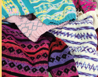
KNIT/SEWN ITEM BOXES: 1962