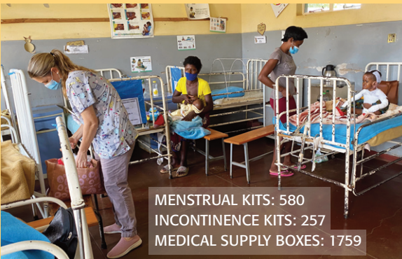
MENSTRUAL KITS: 580 INCONTINENCE KITS: 257 MEDICAL SUPPLY BOXES: 1759