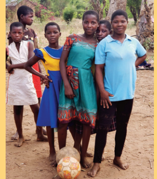
SPORTS BOXES: 259