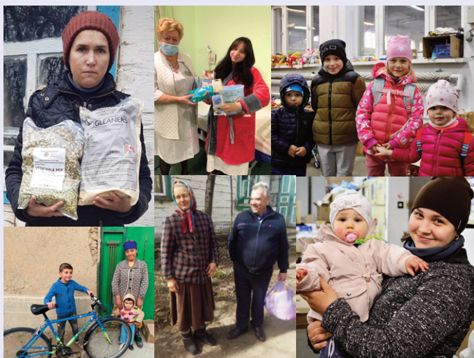
CRW's humanitarian support for the people of Ukraine.

With all this additional support and donations, CRW was able to send 4 full containers of food to Poland/Ukraine; 2 medical loads, 1 container filled with building materials to assist in converting 3 purchased containers into mobile medical clinics, plus 5 other mixed loads. With amazing support from The Times Colonist, Global TV, CHEK news, Black Press and many others in helping to get the word out, relief efforts for Ukraine are ongoing. Donations are still pouring in and we will continue to respond in 2023.