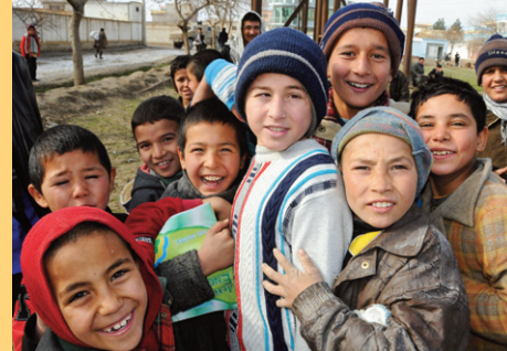
HOUSEHOLD BOXES: 1590