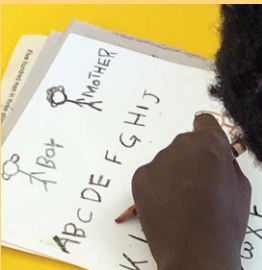
SCHOOL BOXES: 2735