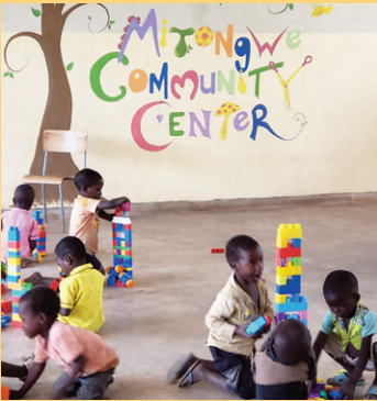
CHILD EQUIPMENT PIECES: 132