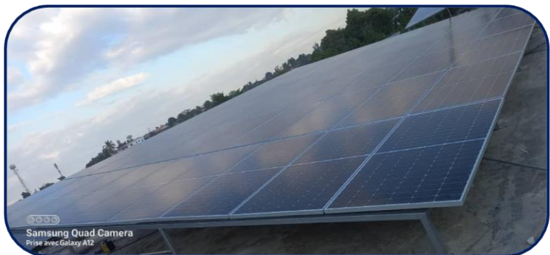
New solar panels at Hope Hospital