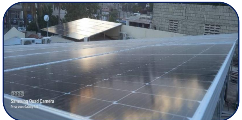
Some of the new panels on hospital the roof