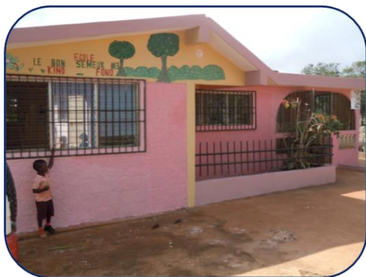
Mussotte Elementary School (above) C-Tech (below)