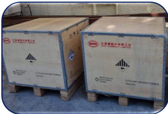
Two new batteries for the system