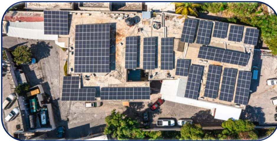
Aerial view of Hope Hospital with panels in place on the roof.

You have been so generous in supporting the solar project we have run out of ways to say "thank you"!