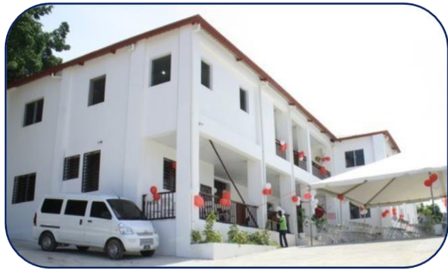
Village Elementary School (above) Hope Hospital (below)