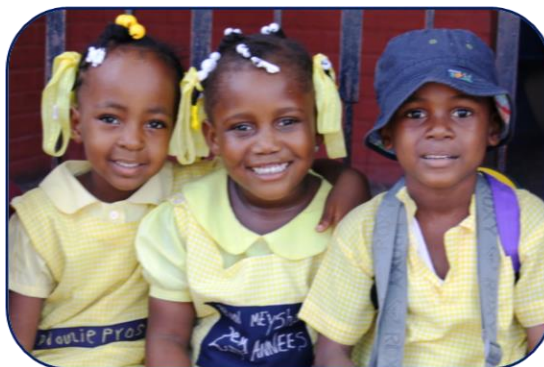
And of course... the children !!