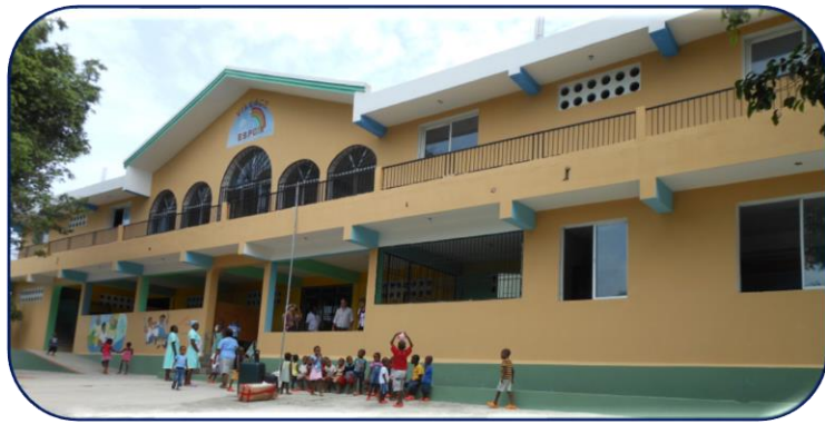
Rainbow of Love Residence (above) Hope Home (below)