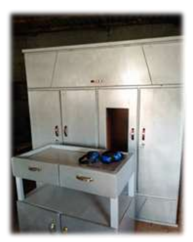
Built by Carpentry Shop

Shoe Shop: The container with all the supplies for the shoe /leather shop has been sitting in Beira for a month. Train wagons to transport it to Zimbabwe are in short supply. However, once the goods are offloaded, we have lots of leather and leather tools, as well as shoe forms and heels, to get the Shoe & Leather Supplies Shop off to a good start. Shoes, purses, wallets, etc. will provide trade opportunities for young men after leaving school. This is a fantastic donation!