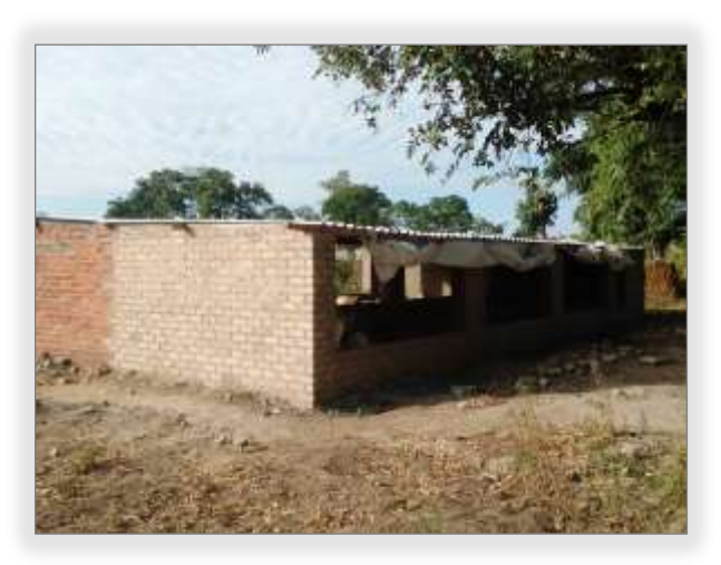
The new community pig sty additions have been finished.

Extensions to the chicken house have been completed. We can now house 400 chickens. Broilers are doing well and pay a good sum of the wages.