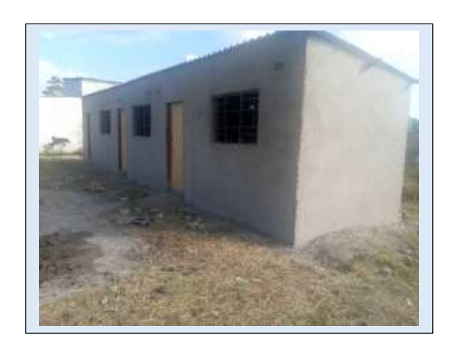
Shoe Shop and Hairdresser