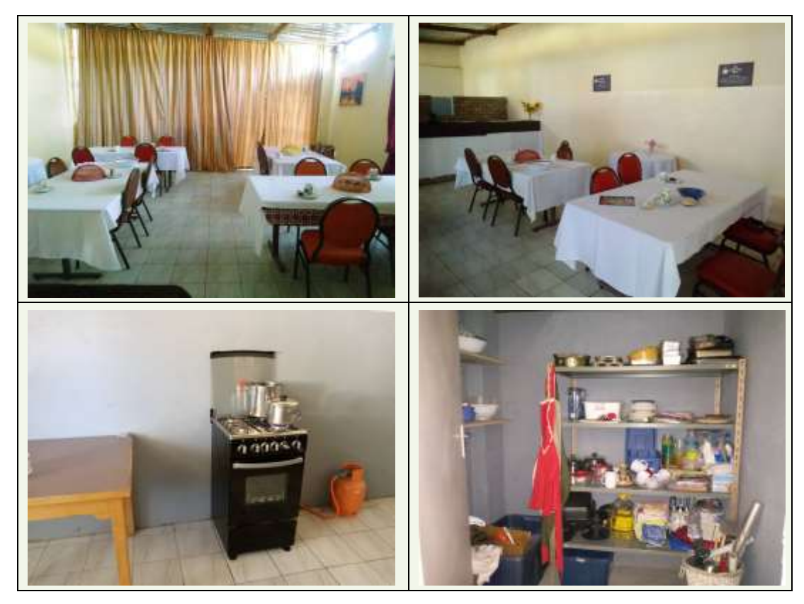
Tea Room Oven

They will build a community of love and trust is our hope.