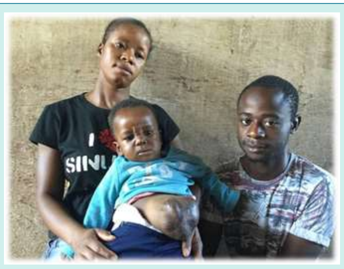
No More Teasing!