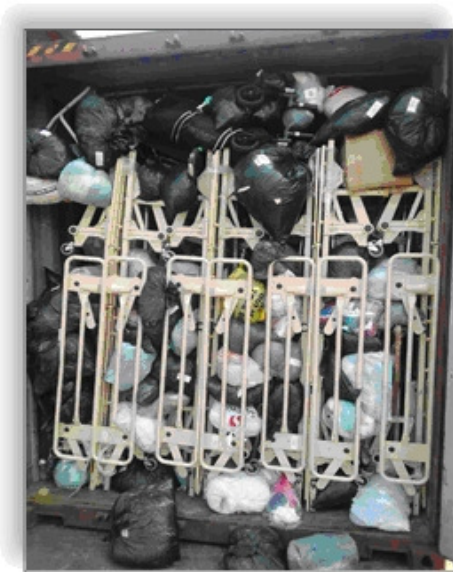
Left: Hospital Beds Tightly Packed in Container by MEMO

If you would like to be a part of this ministry, would you consider helping us to pay the necessary $3,000 in costs to receive a container, pay a shipping agent, pay duty, as well as the landing, truck, crane and delivery fees? Donations would go to the same address as mentioned in Matching Donation section of this newsletter. Just please be sure to specify Account 2-3255 in the correspondence.