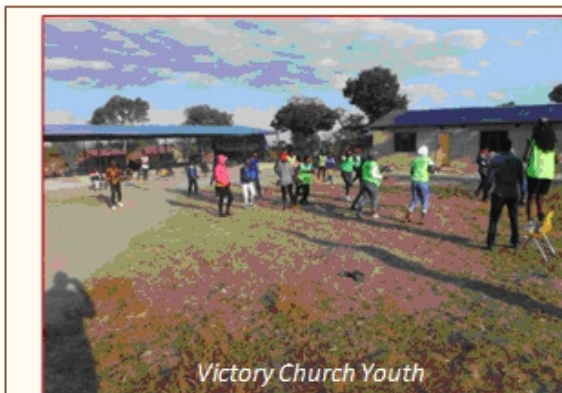
Victory Church Youth