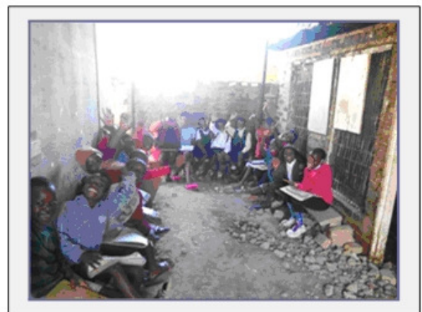
Students in Chugutu loving their library books that were recently sent

Registration for the school already exceeds the number of students the school can accommodate. The kids are going in even without a floor in place yet. They may need to wait quite a while for the floor. Early childhood education to Grade 12 is the goal.