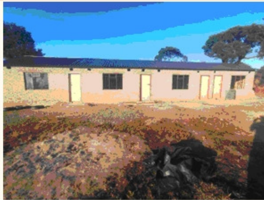
Above: Victory Church Pre-school being built 2 pre-school rooms and sewing room in progress

To date, the community has made all the bricks for two pre-school rooms. A third room which will be used for a sewing program is still in progress. The community also plans to make bricks to enclose the church, but this is a considerably bigger project that will need to wait a while longer.