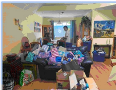
Noah is also sorting and packing