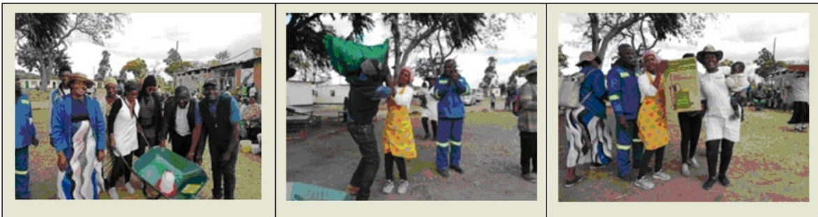
A team from another community won the coveted wheelbarrow prize!

The local Councillor for Ward 25, where Rasper and many other communities are located, asked if the Rasper Community Center would host this year's Agriculture Show. They were delighted to do so and even more delighted when they won two prizes! As we develop more wells and farming, there is sure to be much more competition.