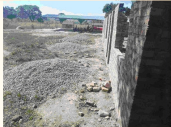
To the rear: Victory Church Framing To the right: School Under Construction