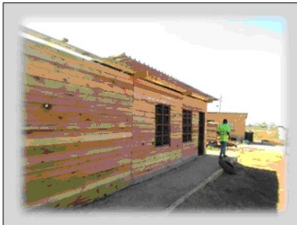
Building the new Chugutu School

The school in Chugutu is almost ready for students. The roof is being built and I am delighted to say that furniture is or will be in one of the containers.