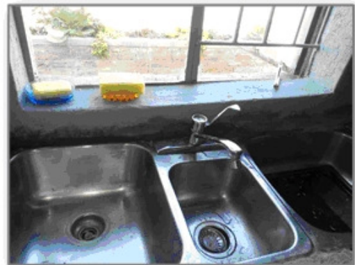
Even the kitchen sink was in the container LOL

EFCCM are also supporting Zimbabwe through their Benevolence Fund as starvation is already happening in this nation. There were good rains this year; the crops were growing very well and then a hurricane which started in Mozambique came through Zimbabwe, flooding and ruining the crops. That same hurricane also destroyed some of our pigsties, lifting off the roofing and walls.