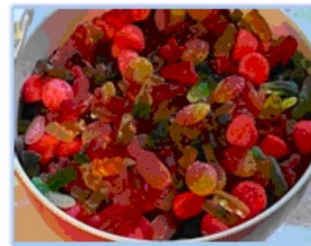
A close-up view of some of the treats for Happy Day bags